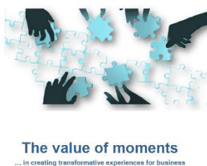
Value of Moments