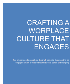
Crafting a workplace culture (based on a sense of belonging)