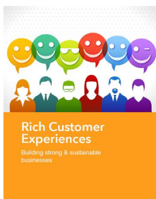
Rich Customer Experiences